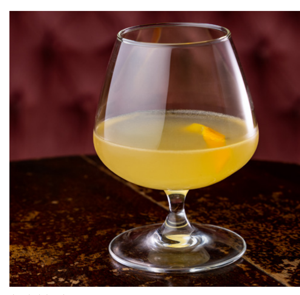
The Irish Whiskey Side Car

The fruitier the better for your Irish Whiskey choice here, any of your favourite Malts or Pot Still should work exceptionally well.