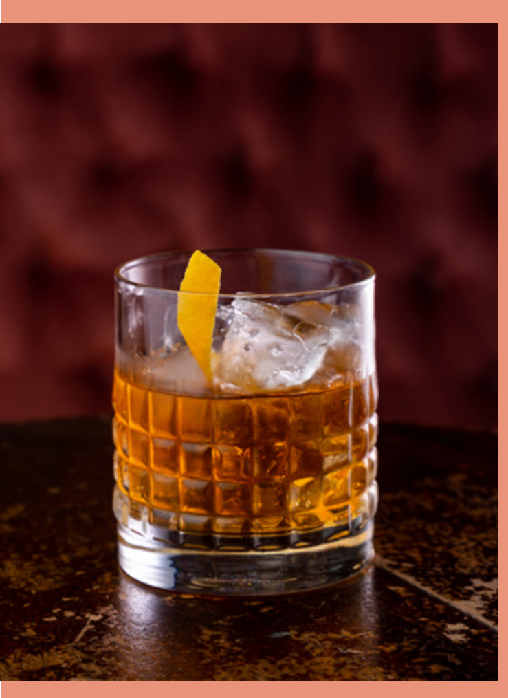
The Irish Whiskey Old Fashione

As a rule of thumb if the cocktail doesn't contain citrus juices it can be stirred rather than shaken.