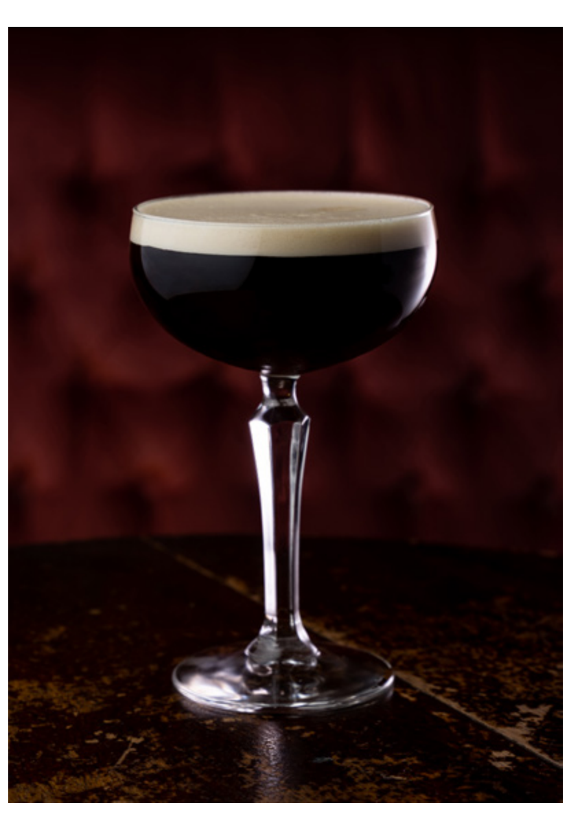
The Irish Whiskey Espresso Martini

This cocktail can be batched up and served as over-ice as a cold brew alternative, providing a refreshing options for parties & events.