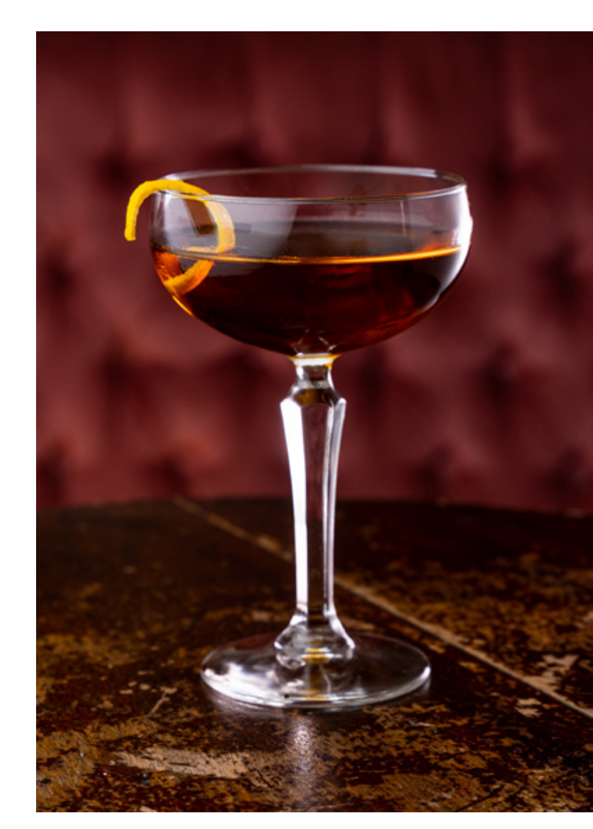
Irish Whiskey Tipperary

We recommend a full-flavoured multi-cask matured Irish Whiskey for the Tipperary as you will need a whiskey which will stand up to the Chartreuse & Sweet Vermouth.