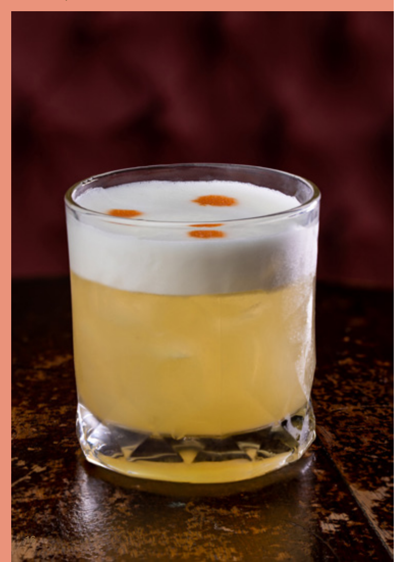
Irish Whiskey Sour

Many of our favourite cocktails are shaken rather than stirred, this helps combine the citrus juices and ensures our favourite sour cocktails are well-balanced. The sweeter and rounder Irish Whiskeys shine through incredibly in these cocktails.