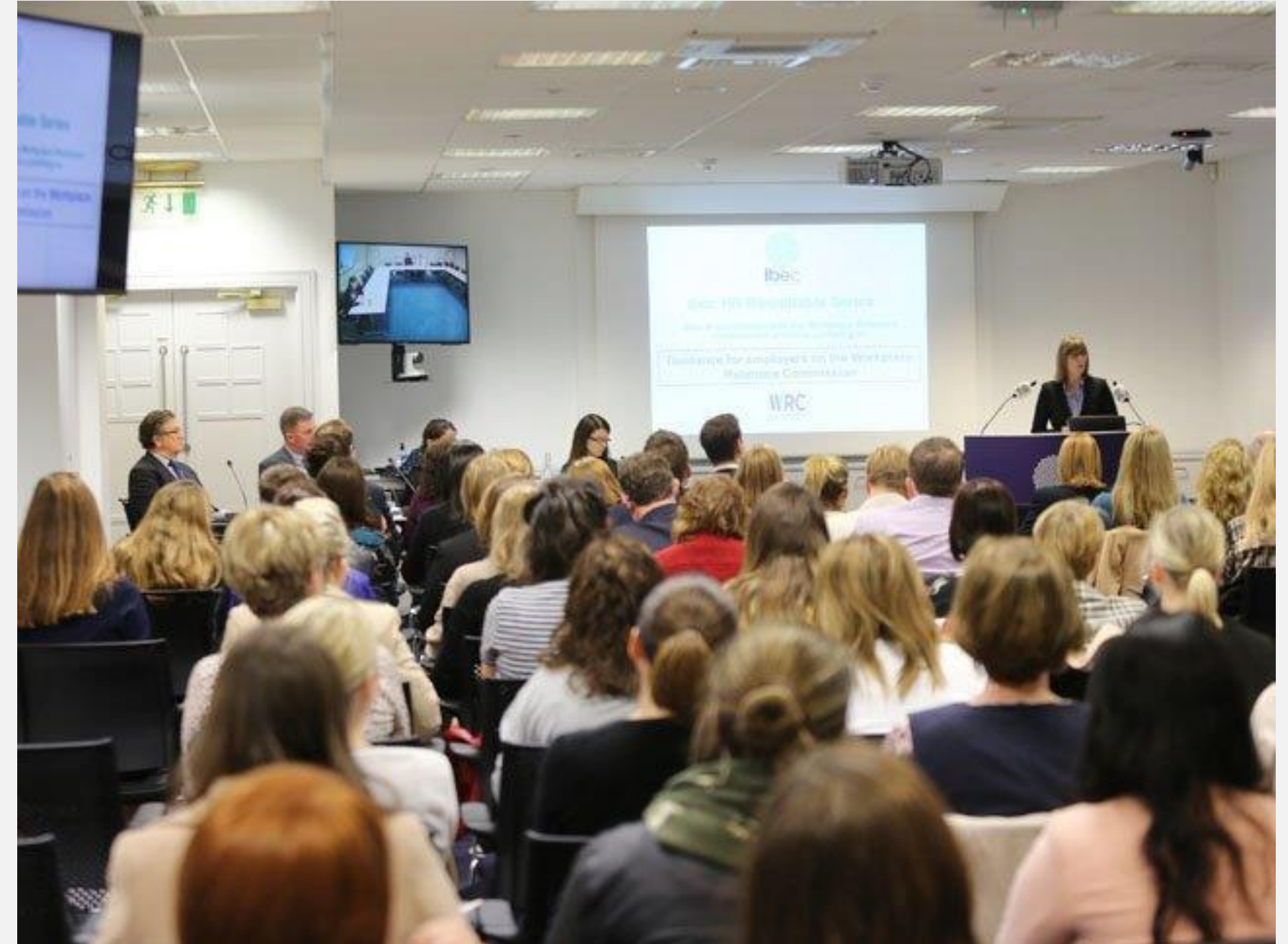
Expert HR briefings