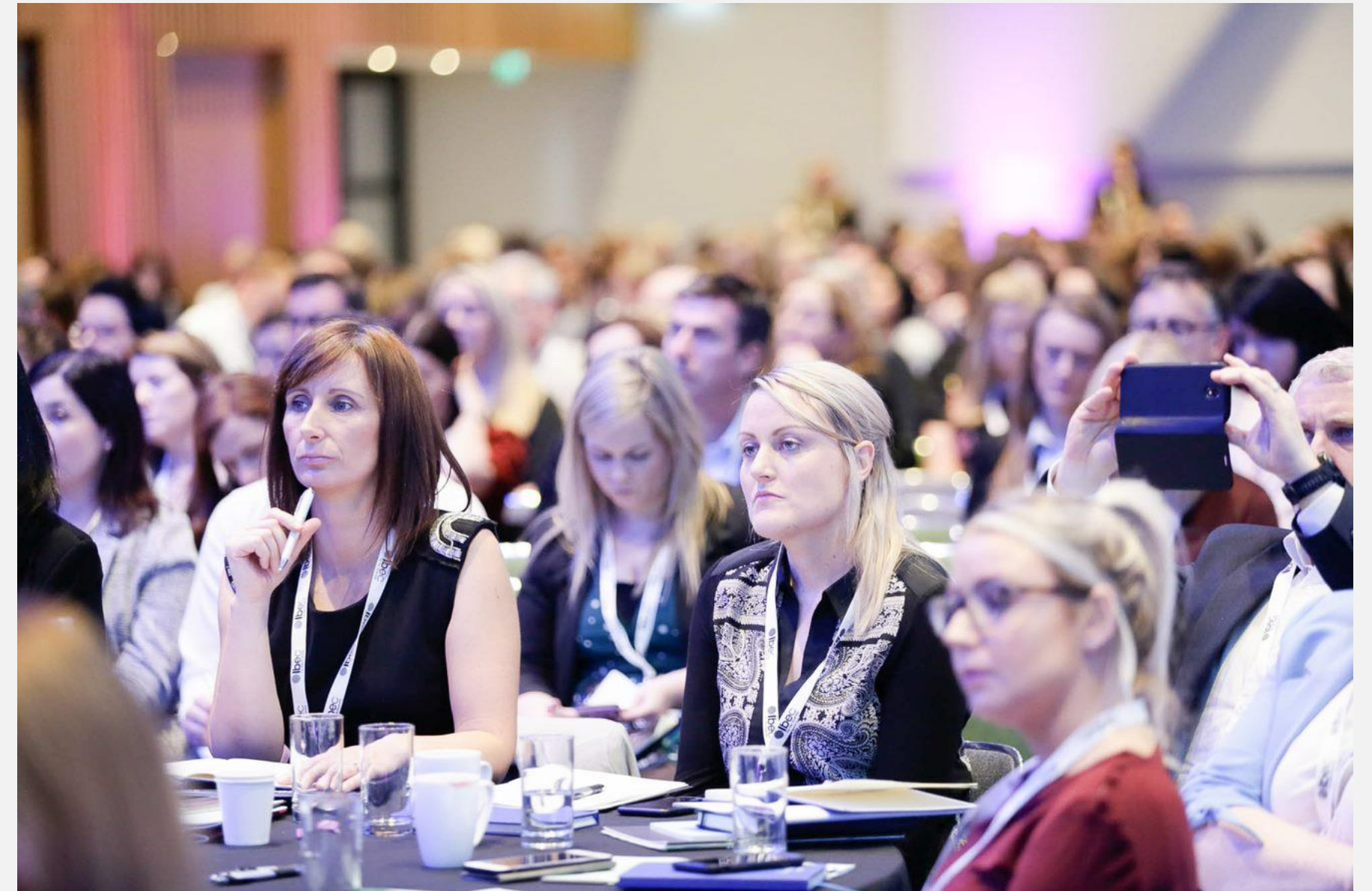
Ireland's leading conference for HR Leaders.