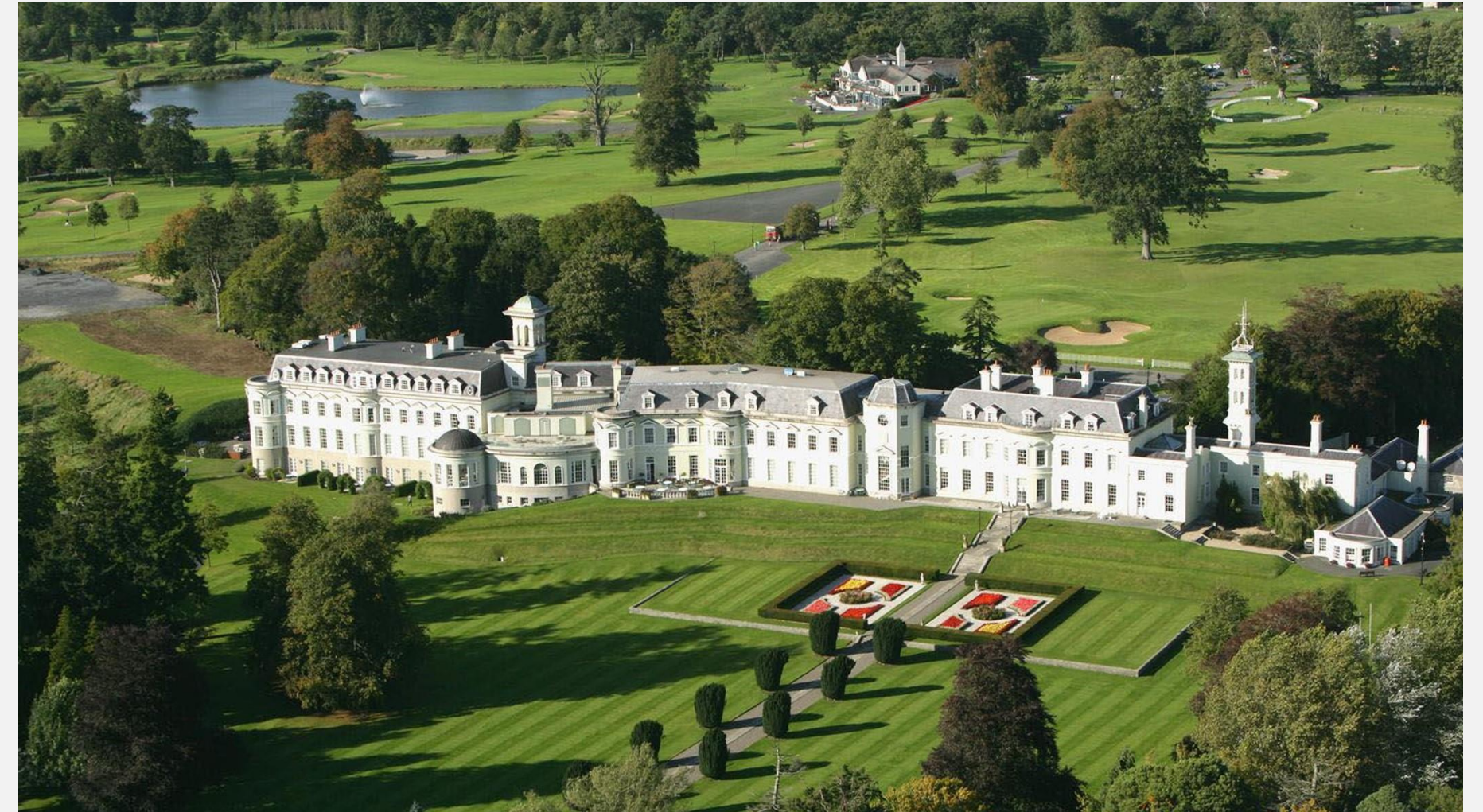
2023 A vision for social cohesion