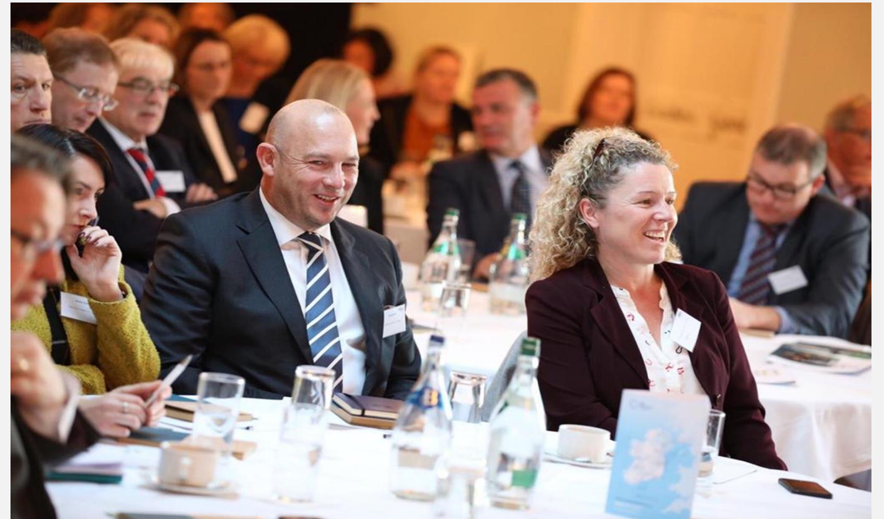
Regional prosperity and a sustainable economy