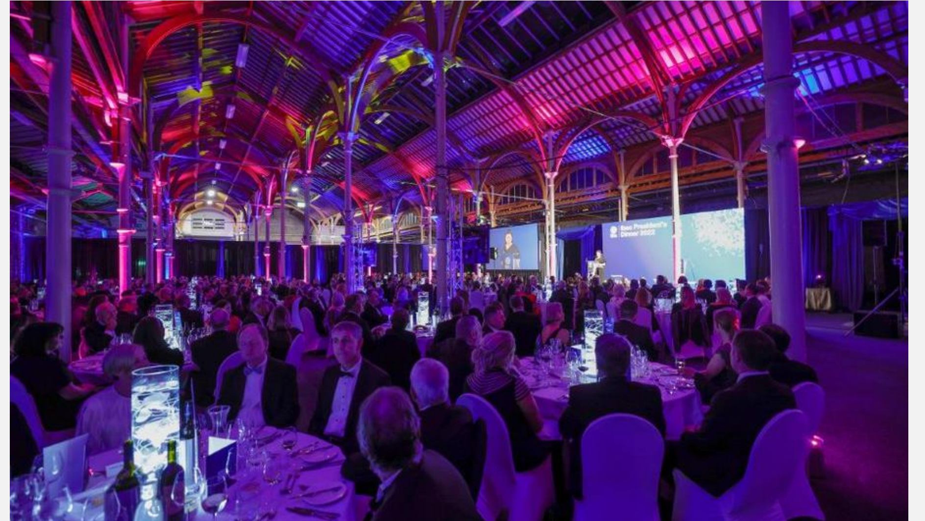
Celebrating 30 years in 2023