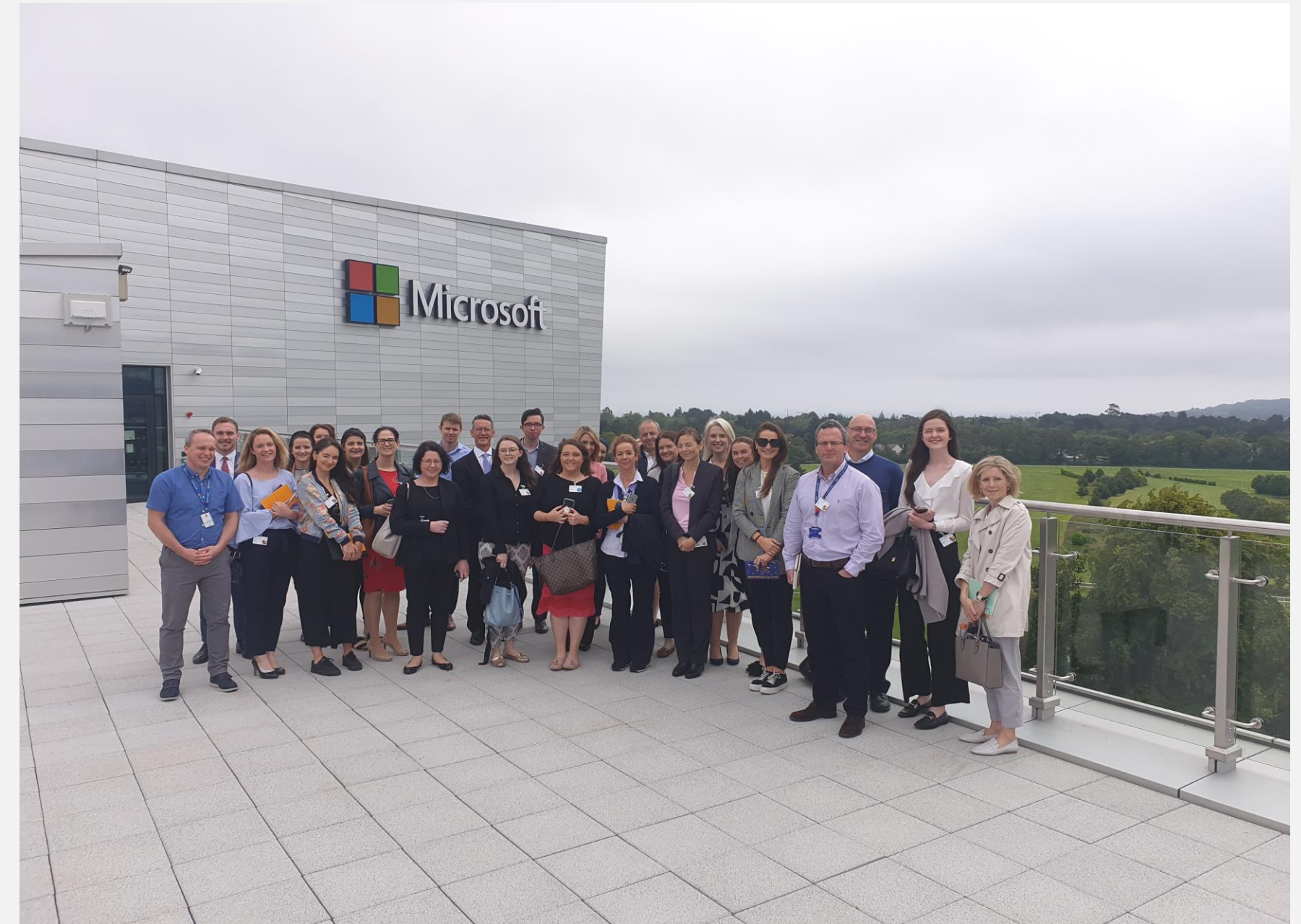
KeepWell Clinic hosted in Microsoft with a focus on Nutrition