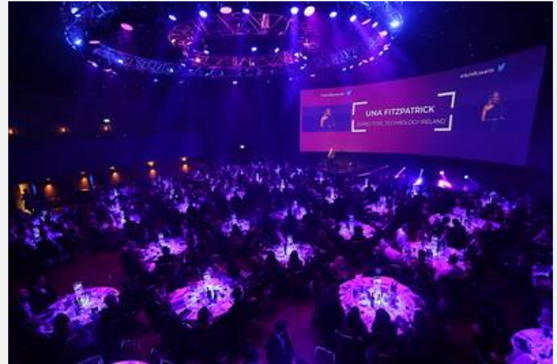
Technology Ireland Industry Awards